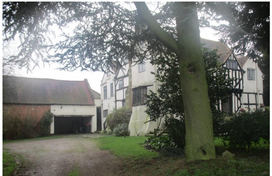
Figure 1: Barn where Hartshill Friends held their early meetings.

present meeting house stands) for a school and school master's house be built. The exact date of the buildings are unknown, but it is suggested that they were built by 1754.