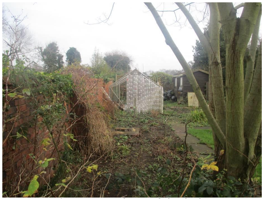
Figure 8: Eco-greenhouse made from bottles

The meeting house is set back from the road with a small brown brick boundary wall and the front garden is well planted with trees and shrubs. A sweeping drive from Castle Road leads to an area of car parking to the south-west of the meeting house. To the rear of the building is a garden which is being developed as an eco-garden with a plastic bottle greenhouse. To the east of the meeting house is Hartshill allotment site.