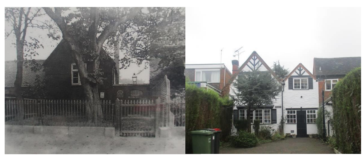
Figure 2: Purpose- built meeting house in Hartshill Green dating from 1740, undated image

Hartshill Meeting ceased in 1838, as a result of declining members. Some thirty years later Arthur Naidh and Edwin Brewin moved into the area and the Meeting was revived.