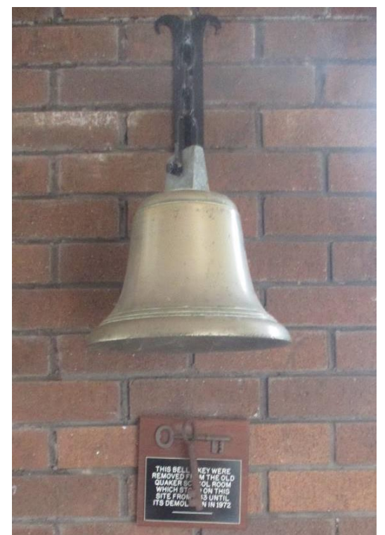
Figure 7: Bell and key from former Quaker School dating from 1740

The lobby area contains a bell and key which were salvaged from the former school room which stood on this site (1743 - 1972).