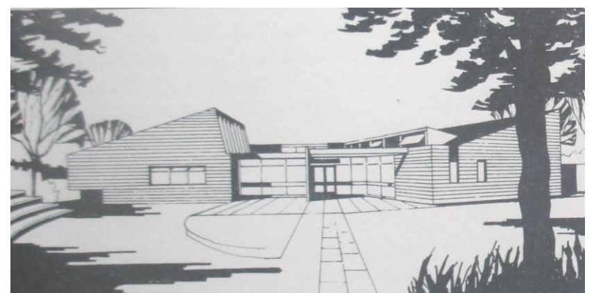
Figure 5: Initial design of meeting house on appeal leaflet

In 2011, following a Disability Access Audit extra foyer space was created in the meeting house to provide easier access around the ground floor and a fully accessible WC was added.